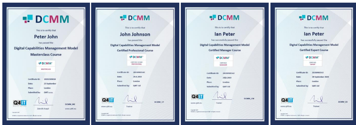
Picture 3: Examples of certificates provided by the licence provider

Fast and costs free on boarding process is available for strategic partners who will be provided extra support and competitive market advantage: